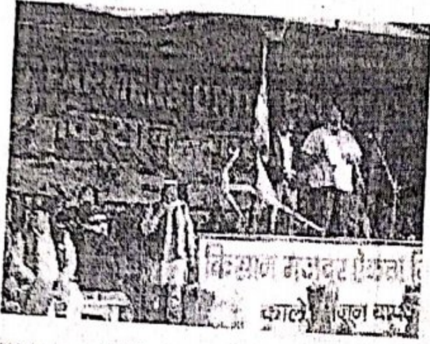
16012021 kisaan.jpg 162K