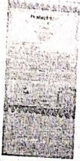
farm certi.jpg 94K